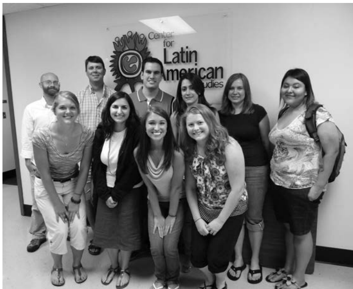
▲ First-year MALAS students.