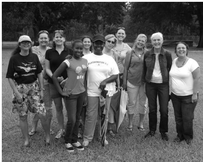
▲ Participants of the Ecosystems of Latin American Teacher Institute.

The Center's Outreach Program held its first summer teacher institute focusing on the sciences in July 2011. The Latin American Ecosystems Institute emphasized the use of emerging technologies and local resources to address state science standards and continued the Center's efforts to integrate Latin American content beyond the K-12 social studies and foreign language curriculum.