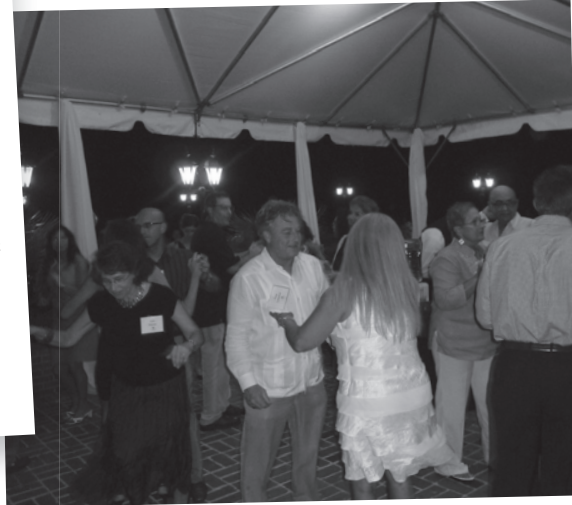
▲ The UF President's House was a lovely venue for the reception.