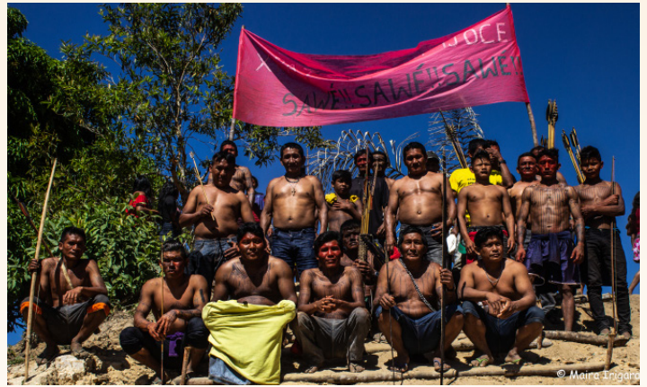
Mundurucu Warriors